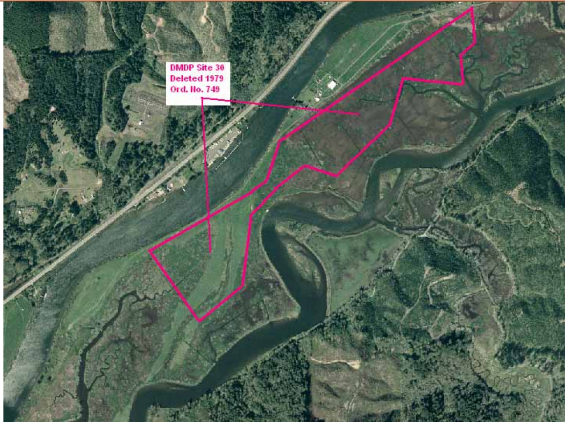
2004 aerial with site boundaries

RCP/ CRMP Plot No. 51 TRS Map: 18-11-15 Tax Lot(s): 1000 River Segment: 4 Location: River Mile 11 Vicinity: Across (south) Siuslaw River from Midway Dock Base Zone: Exclusive Farm Use E25 CRMP Combining Zone: Natural Resource Conservation /NRC (M. U. 29